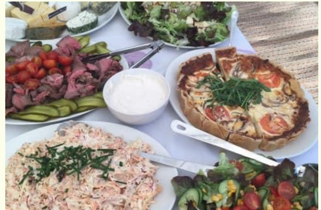
Wedding Catering - September 2019